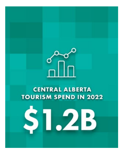
Tourism's economic impact